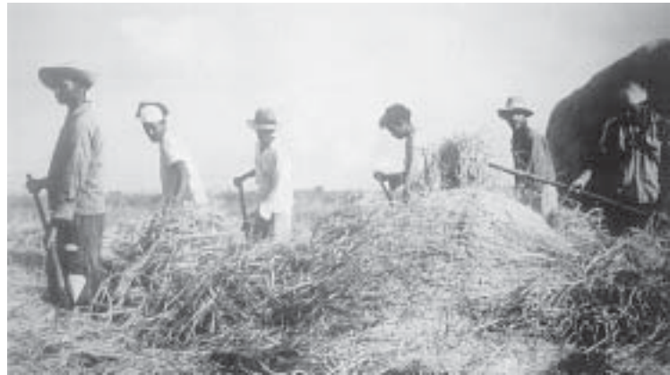
Hindustani Surinamese working in sugar plantations