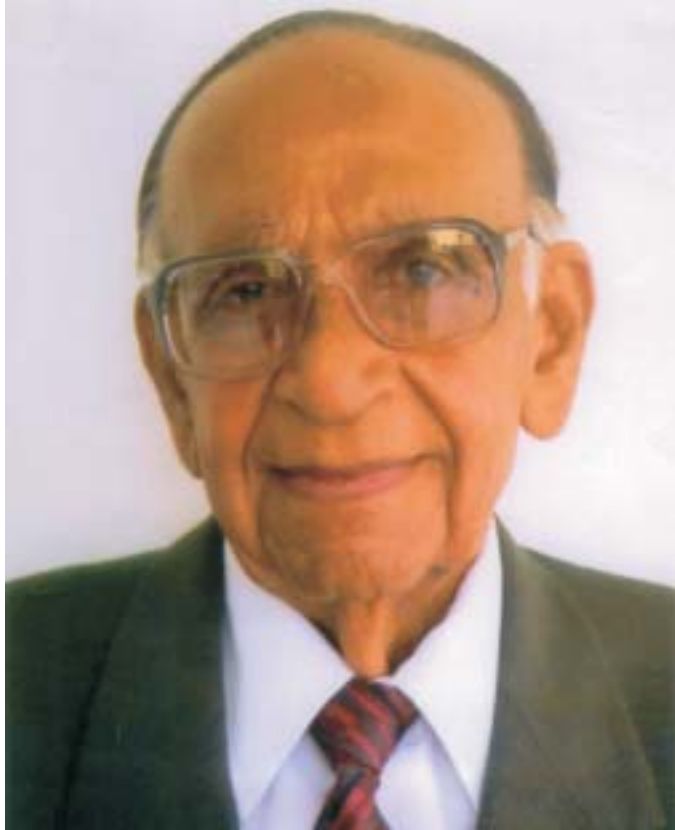
H.E. Late Mr. J. Lachmon, former Speaker of the National Assembly, Republic of Suriname