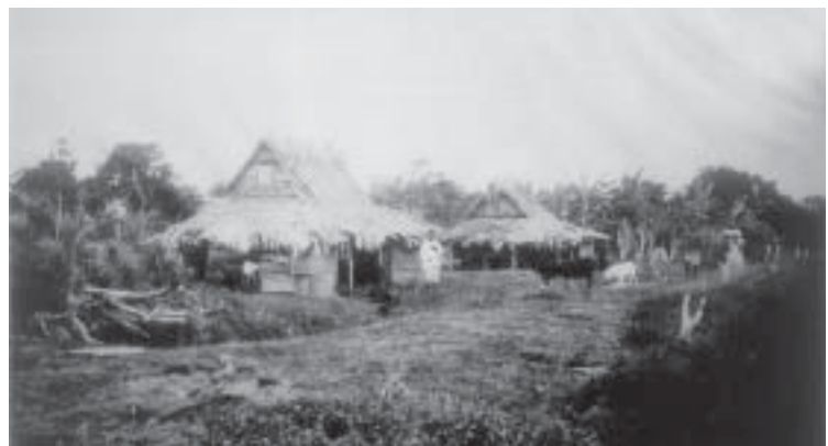
Huts of Indian plantation workers in earlier times