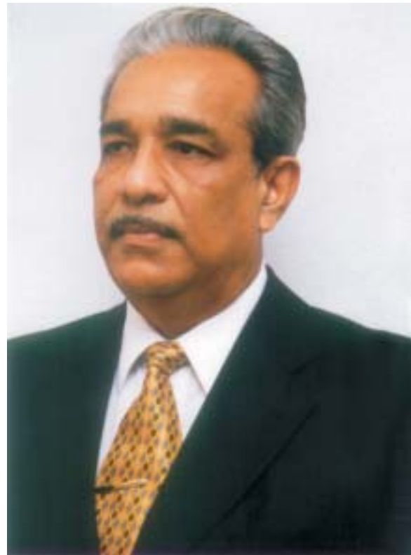
H.E. Mr. Jules Rattankoemar Ajodhia, Vice President of Suriname